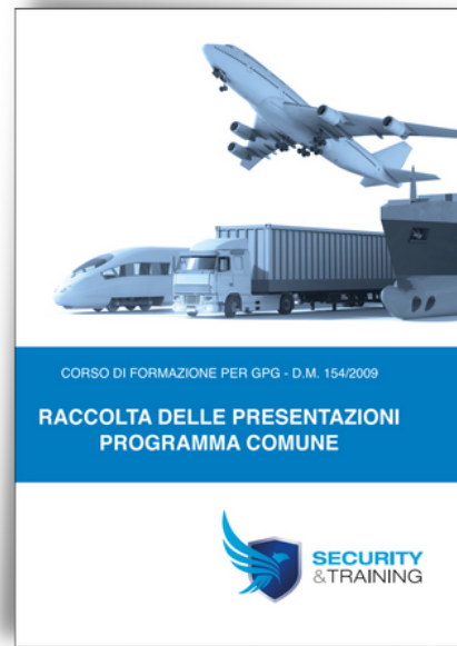
SYNOPSIS FOR SECURITY GUARD COURSES - DM 154/2009