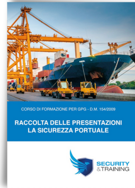
PORT SECURITY FOR SECURITY GUARD COURSES - DM 154/2009