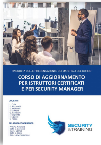
CERTIFIED INSTRUCTORS AND SECURITY MANAGER