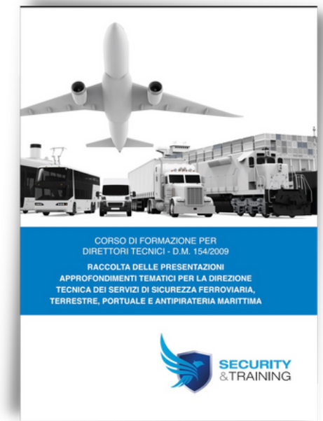
TECHNICAL DIRECTORS DM 154/2009