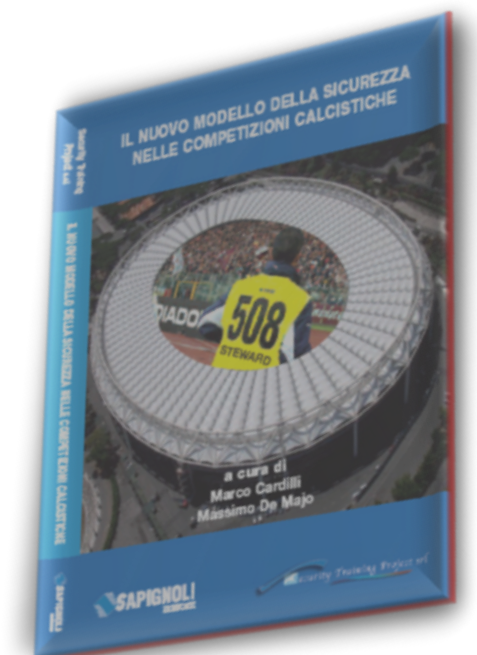
SECURITY IN SPORTS EVENTS