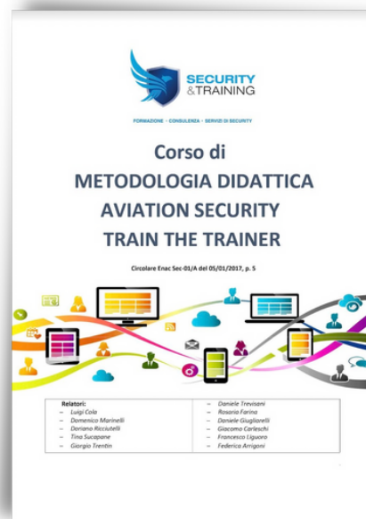
AVIATION SECURITY TRAIN THE TRAINER