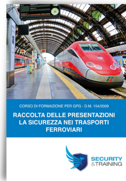
RAILWAY SECURITY FOR SECURITY GUARD COURSES - DM 154/2009